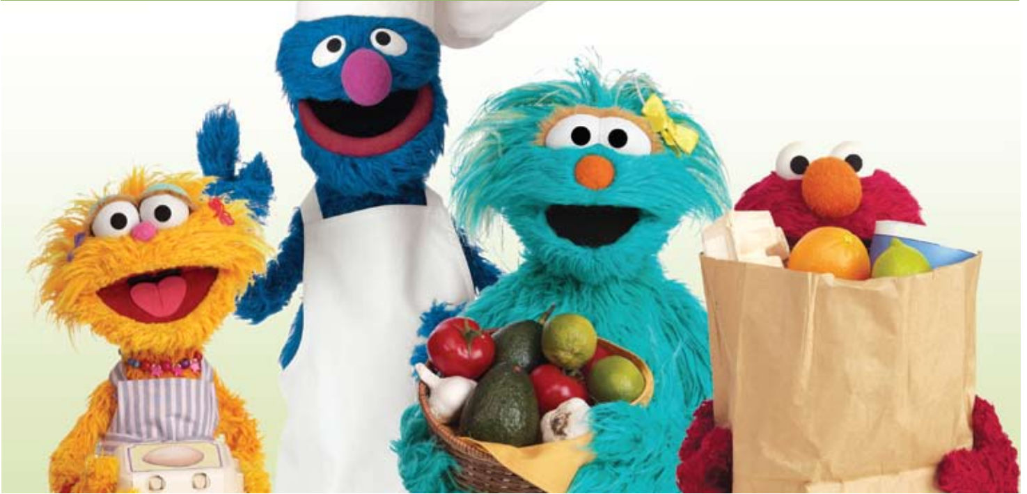
"Sesame Workshop"®, "Sesame Street"® and associated characters, trademarks and design elements are owned and licensed by Sesame Workshop. © 2010 Sesame Workshop. All Rights Reserved.